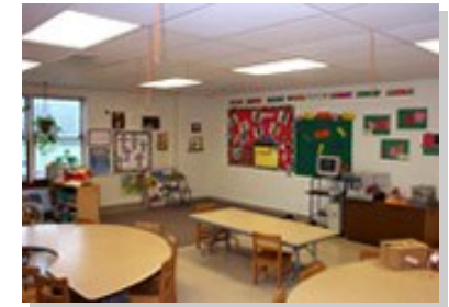
One of Our Preschool Classrooms

To expand their social growth, very basic rules for relating to others in the group are stressed, such as learning names of classmates, safety habits and learning daily classroom routine. Weekly themes center on one or two shapes and concepts. Crafts may be linked to a particular holiday. Creative investigation of a wide range of medium in art is encouraged.