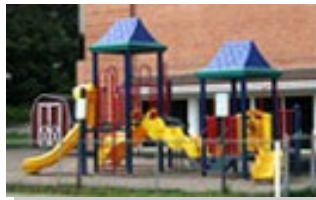
Our Preschool Playground

Readiness for preschool is not always easy to determine prior to the start of school. Ebenezer reserves the right to request removal of a student who is found not to be ready for preschool.