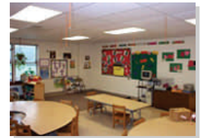
One of our Preschool classrooms

To expand their social growth, very basic rules for relating to others in the group are stressed, such as learning names of classmates, safety habits and learning daily classroom routine. Weekly themes center on one or two shapes and concepts. Crafts may be linked to a particular holiday. Creative investigation of a wide range of medium in art is encouraged.