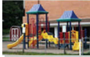
Our Preschool playground

Readiness for preschool is not always easy to determine prior to the start of school. Ebenezer reserves the right to request removal of a student who is found not to be ready for preschool.